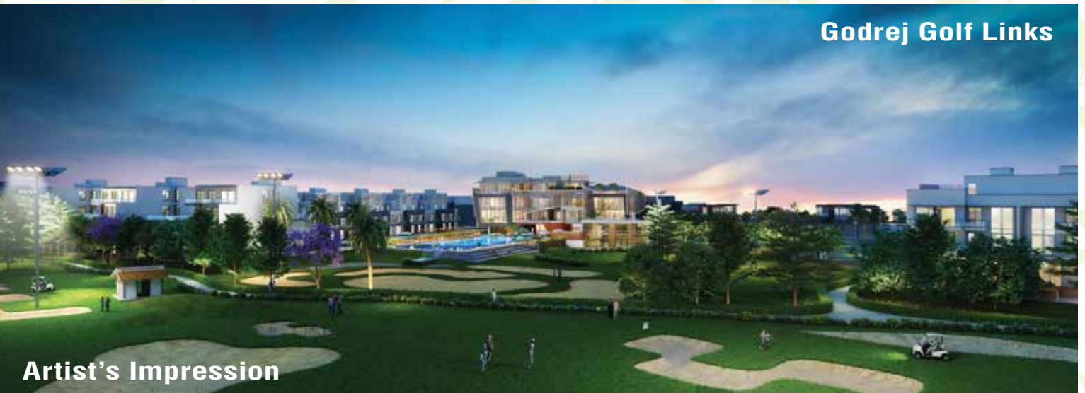
Godrej Golf Links