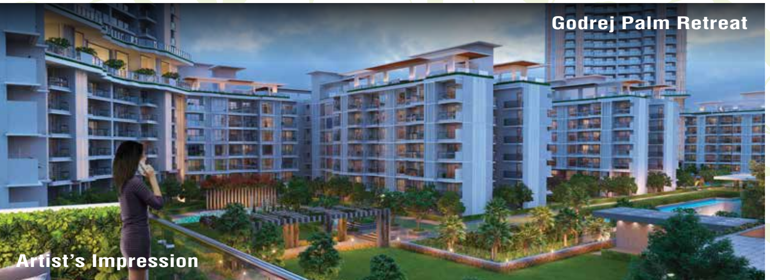
Godrej Palm Retreat