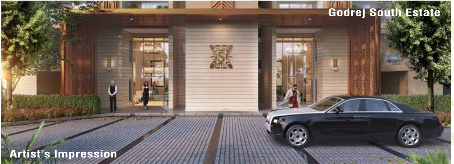
Godrej South Estate