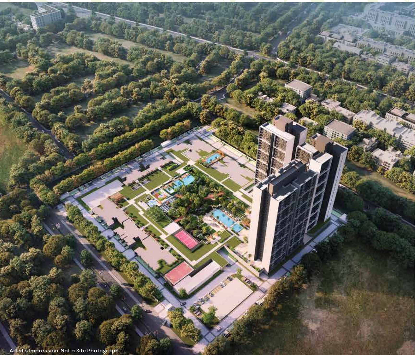
Artist's Impression. Not a Site Photograph.

Your home in Godrej Woods offers you the best of both worlds. One world has lush green landscapes woven in a natural forest for you. And the other world has every convenience you have ever dreamt of, in its vicinity.